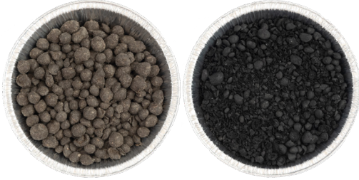
Biochar C stability compared to a set of 92 biochar

Key features: • Reproducible • Extensively characterised • Readily available