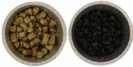
Biochar C stability compared to a set of 92 biochar

Key features: • Reproducible • Extensively characterised • Readily available