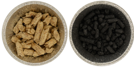
Biochar C stability compared to a set of 92 biochar

Key features: • Reproducible • Extensively characterised • Readily available