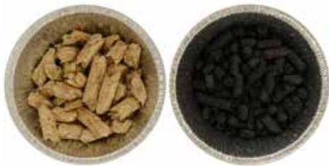
Biochar C stability compared to a set of 92 biochar

Key features: • Reproducible • Extensively characterised • Readily available