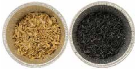
Biochar C stability compared to a set of 92 biochar

Key features: • Reproducible • Extensively characterised • Readily available