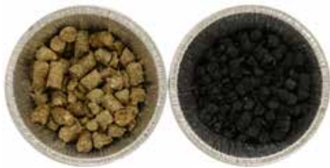
Biochar C stability compared to a set of 92 biochar

Key features: • Reproducible • Extensively characterised • Readily available