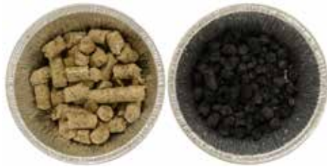
Biochar C stability compared to a set of 92 biochar

Key features: • Reproducible • Extensively characterised • Readily available