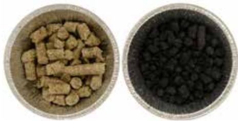
Biochar C stability compared to a set of 92 biochar

Key features: • Reproducible • Extensively characterised • Readily available